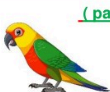
( parrot – thief )