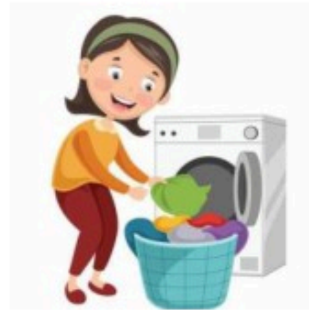
do the laundry