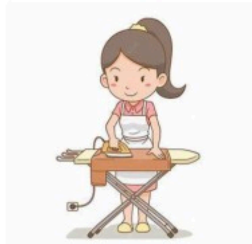
iron the clothes