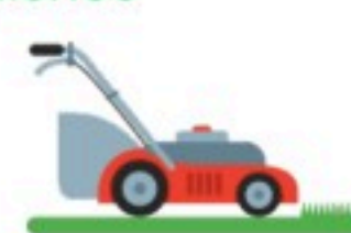
Mow the lawn