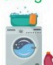
Do the laundry