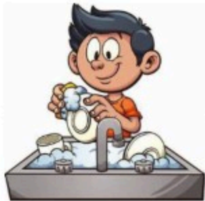
wash the dishes

do the laundry – iron the clothes – go bowling – hang out – wash the dishes