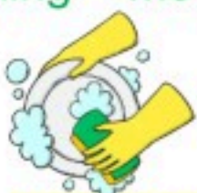
Wash the dishes

go bowling - mow the lawn - do the laundry - go skiing - wash the dishes