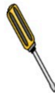
Screw d river