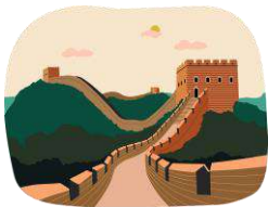
Business man – Football player – Great Wall of China