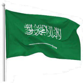
Pizza – graduation day – Saudi flag