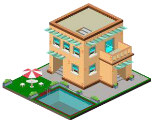
Bookstore – Hotel – Gym

❖ Write the correct word under the picture.